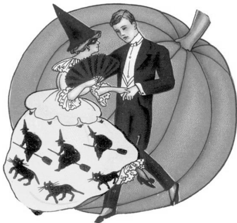
Autumn is upon us!

Now that summer is coming to a close it is time to remember that School busses will be on the roads again. This also means children will be walking to school. Be a cautious driver... our neighborhood children's lives depend on it!